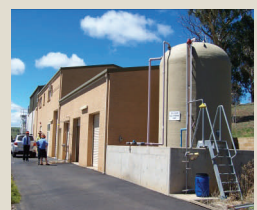
CTW WATER FILTRATION PLANTS