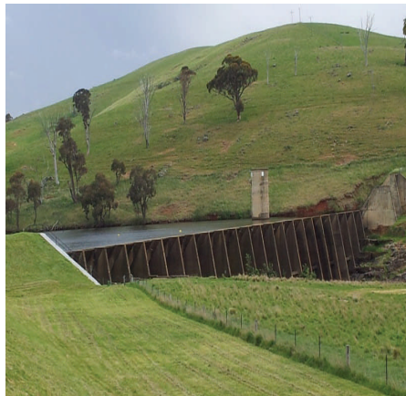
Lake Rowlands Dam

There is uncertainty about the outcomes that may eventuate from the NSW Government Enquiry into the Sustainability of Non-Metropolitan Water Utilities as well as the outcomes from the Independent Review Panel looking into local government reform.