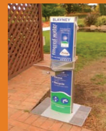
Blayney Filling Station

One Filling Station will be installed each year in a nominated town or village in each of the Council areas with the cost being shared equally between CTW and the two Councils.