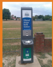
Millthorpe Filling Station